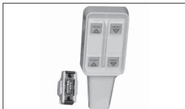
Invacare Pendant Semi-Electric, 9-D Plug, Low Volt