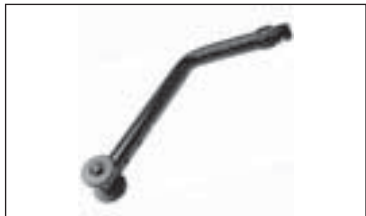
Rear Anti Tipper To fit: Invacare 9000 XT, SL & SX