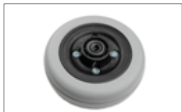
Caster Assembly 6" x 2" 2-Pc Black, Grey Urethane Tire To fit: Invacare Power Chairs