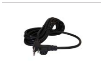
Power Cord Runs from the junction box to the wall outlet. 12'