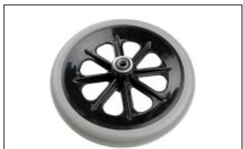
Wheel Assembly 8X1" Black Plastic Caster To Fit: Invacare Standard